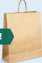
Recyclable Paper Bag for 10¢