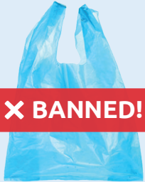
Single-use Carryout Bag